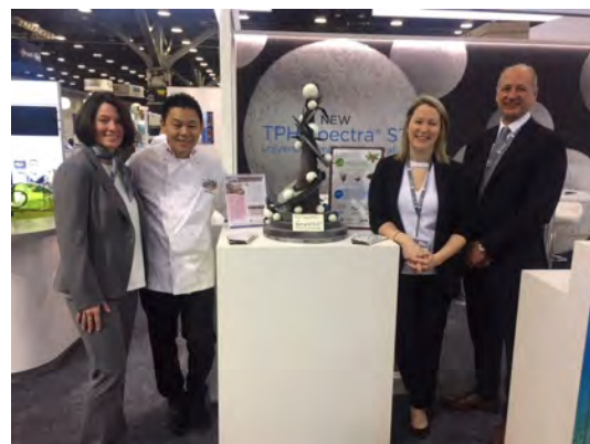
Pacific Dental Conference 2018