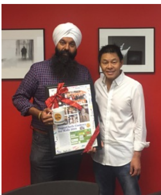
MP Randeep Sarai, Surrey Centre